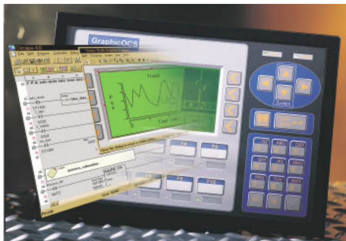
OCS250 – The complete controller...

The OCS250 will accommodate up to 4 SmartStack™ modules. There are over 35 different types of SmartStack I/O modules to select from. The display is an adjustable-backlit LCD that supports Windows® True-Type Fonts and up to 240 x 128 pixel graphics.